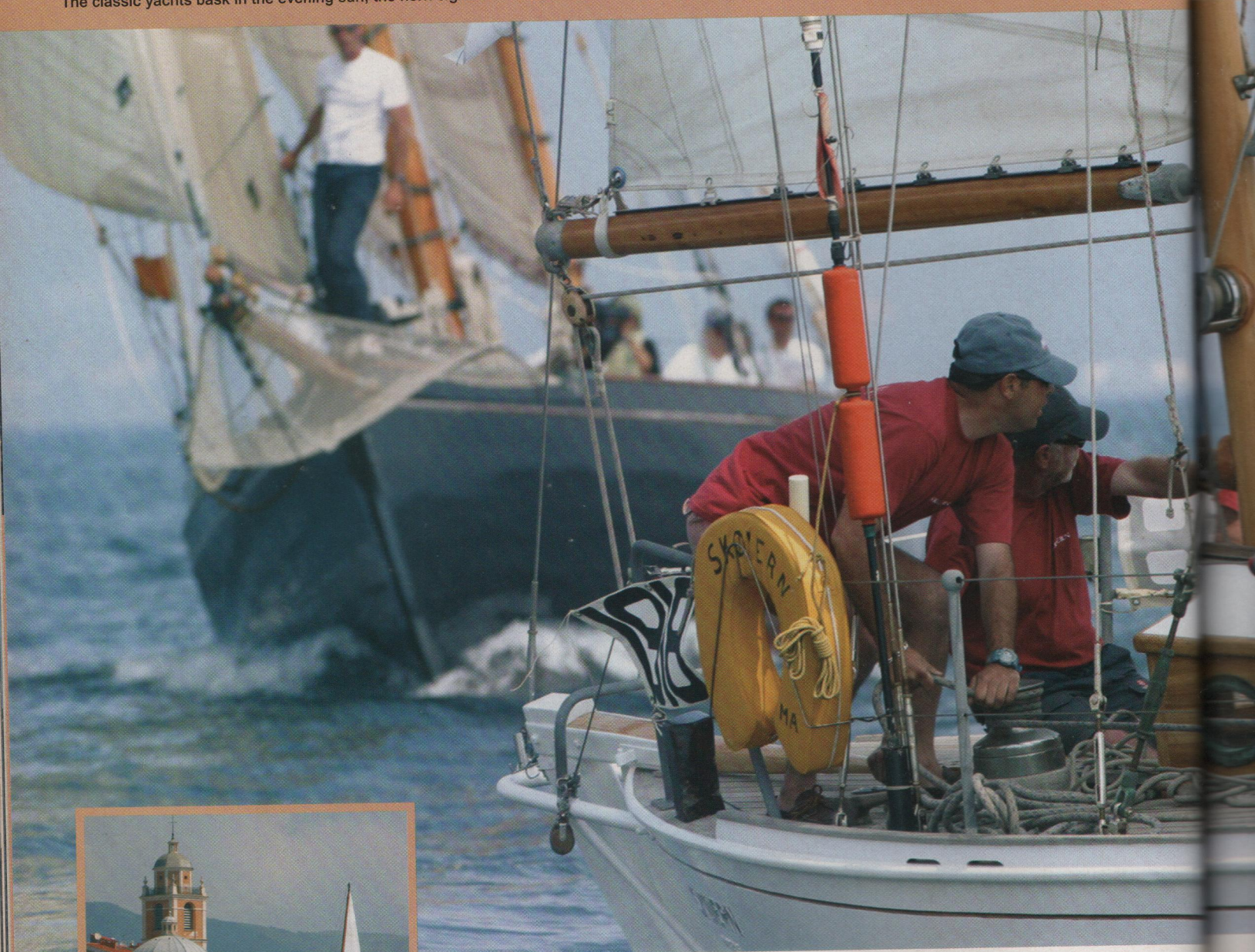
The classic yachts bask in the evening sun; the horn signals the start of the following day's race and the fleet spreads out in the Gulf of Ajaccio